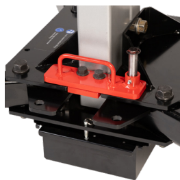
MAST LOCKING PLATE